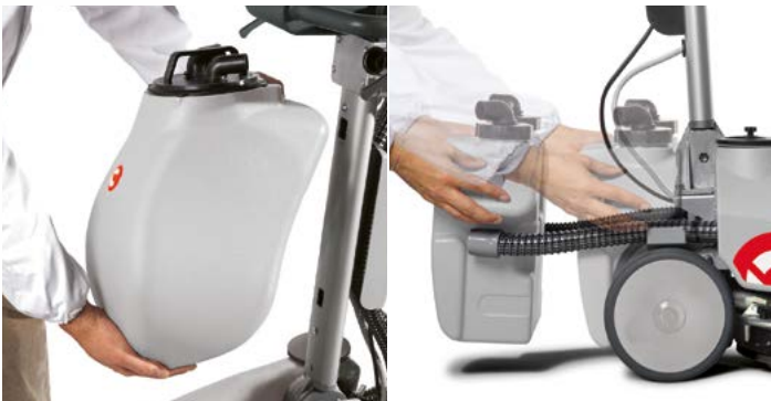
Dirt is collected in the recovery tank which is easily removed for effort-less emptying