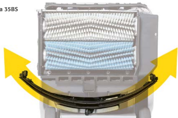
Parabolic squeegee Thanks to the combined action of the suction motor and the squeegee swinging around the brush, perfect drying is ensured also on bends