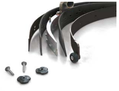
Vispa 35 E-B-BS In order to ensure excellent drying performance, the squeegee rubbers should be kept always clean. When worn out, they are very easy to replace