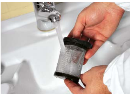
Vispa 35 E-B-BS Simple and practical thorough cleaning of the suction filter