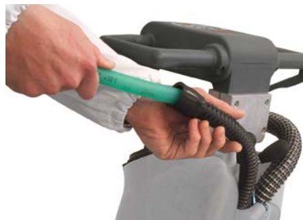
Vispa 35 B-BS Periodic cleaning of the squeegee hose to ensure efficient suction