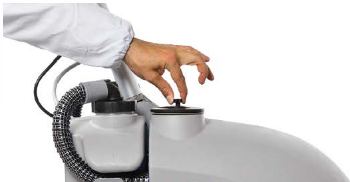
Uniform cleaning path The relief valve on the solution tank cap ensures constant water outflow on the floor